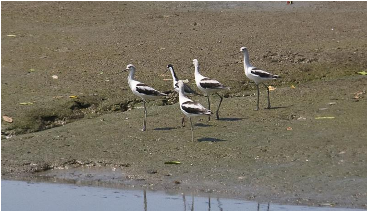
Photo 1. American Avocet R. americana at Costa del Este (Panama).

During the February-March census, the most commonly recorded waterbird in terms of abundance were D. autumnalis (5.169 individuals), T. maximus (1.352) and L. atricilla (1.086 individuals), the latter two being Nearctic migrants (Table 4). In terms of number of observations, the most frequently recorded species included the Spotted Sandpiper Actitis macularius , which was recorded at 20 sites, C. albus and E. caerulea were recorded in 18 sites, Tricolored Heron Egretta tricolor at 17 sites, and Snowy Egret Egretta thula and Black-necked Stilt Himantopus mexicanus were recorded at 16 sites (Table 4). Three species considered Near-threatened at the global level were recorded, including T. elegans (10 individuals), C. pusilla (1 individual) and the Reddish Egret Egretta rufescens (37 individuals).