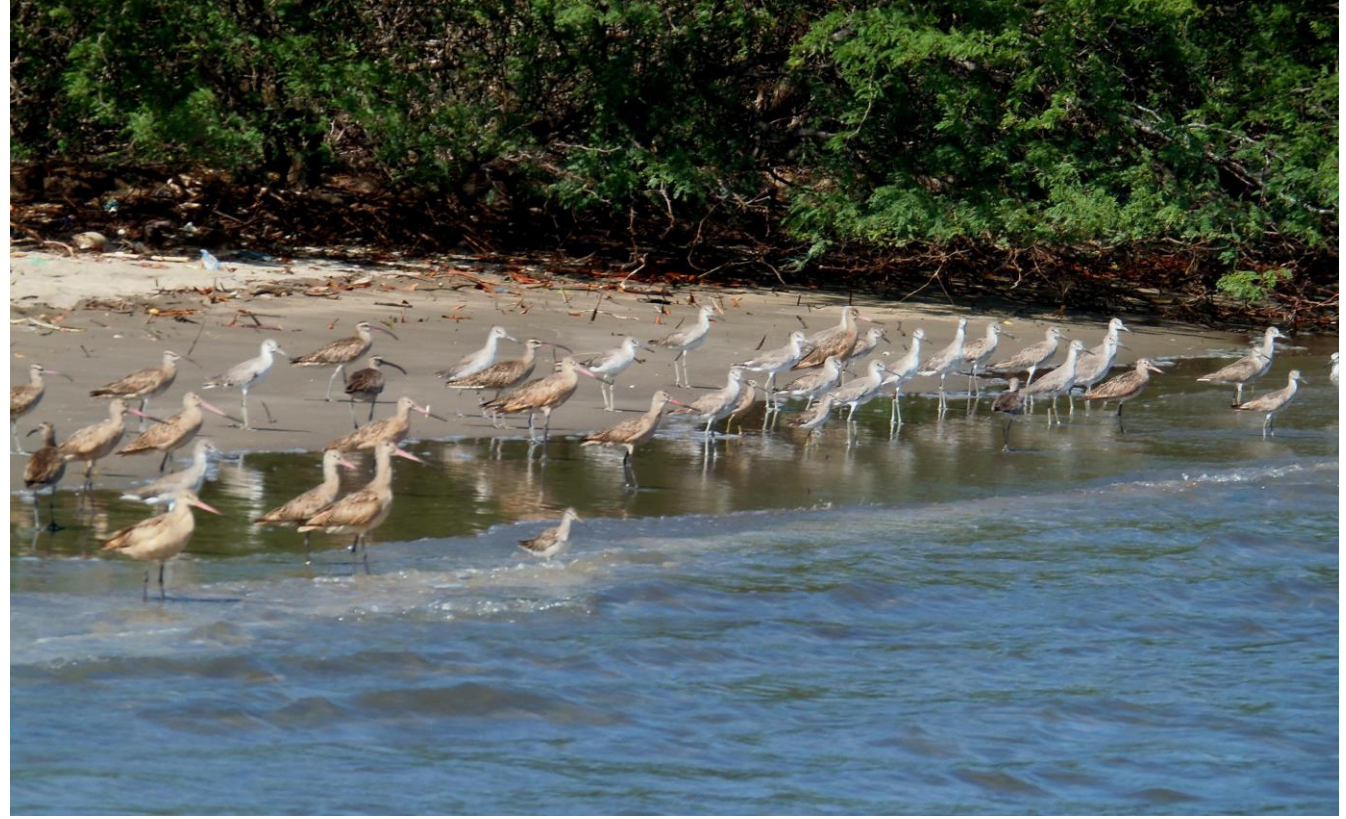
Nearctic shorebirds at Bahía Jiquilisco - Isla Pajarito (IBA: Jiquilisco - Jaltepeque), El Salvador. (July 2012).

Of these, Belize only participated in February-March 2012