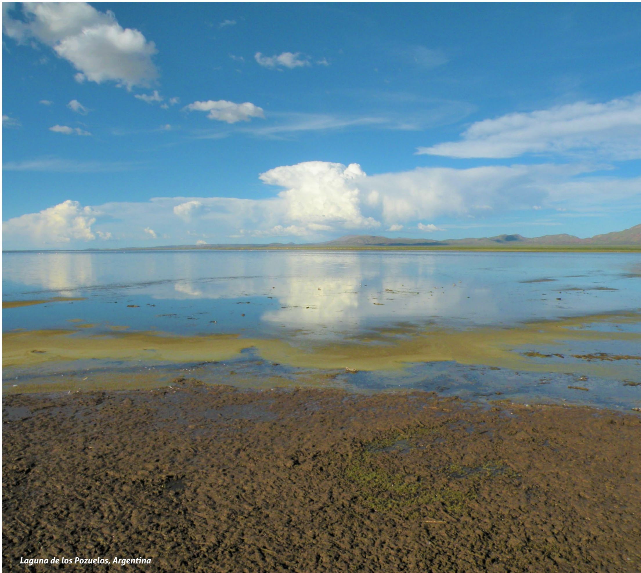
Laguna de los Pozuelos, Argentina