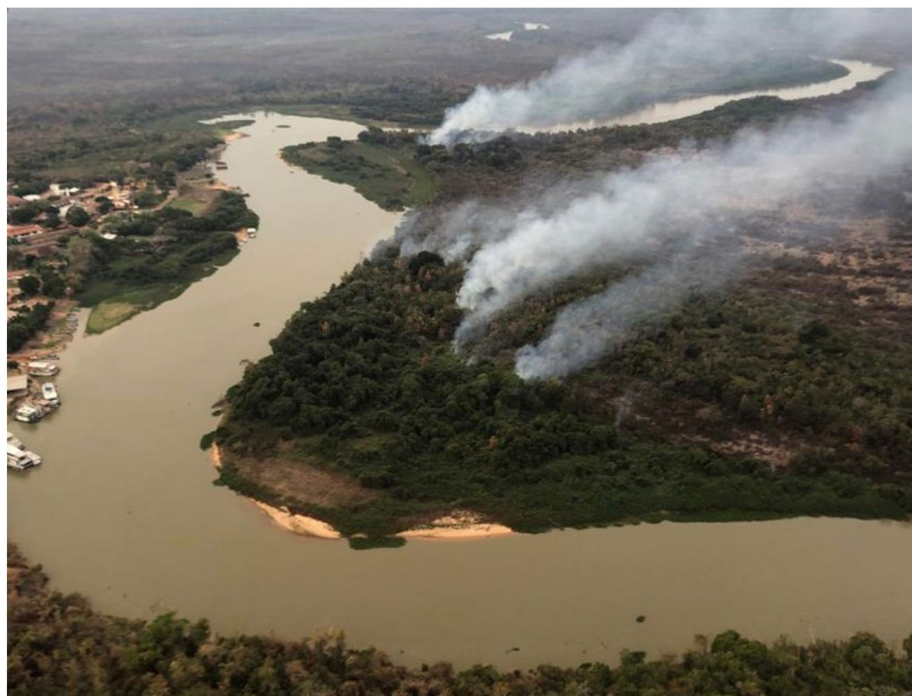
Fires on the banks of the Cuiabá River, in the RPPN Sesc Pantanal Territory

As Wetlands International Latin America and the Caribbean, we are fully identified with our global organizational strategy. Our work will be focused on conserving and restoring habitats and functions in 16 different inland wetland landscapes within the region, including the Paraguay-Parana river system. We want to improve the management of around 4,000,000 ha of inland and coastal wetland ecosystems, including mangroves areas, securing their goods and services, promoting better production practices, preserving local livelihoods and developing more resilient cities and communities. Our efforts are also focused on promoting the conservation of wetlands as carbon sinks and integrated nature-based solutions to the development of infrastructure that reduce the risks caused by impending climate change.