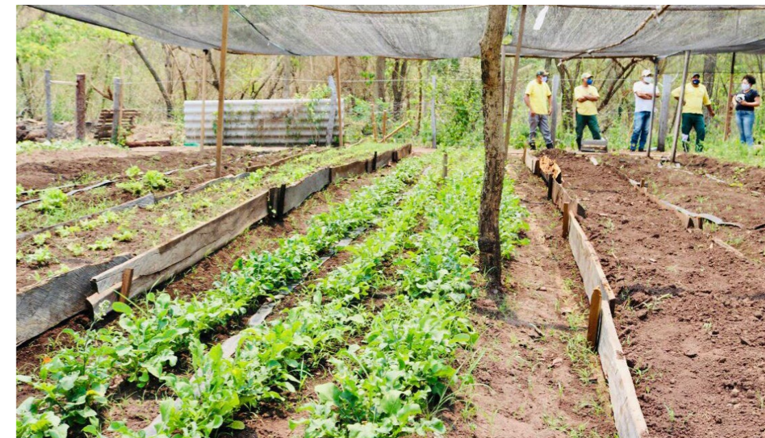
Construction of nursery space and community garden Kadiwéu

Consolidation of current initiatives and new project development will be based in the following premises and opportunities: