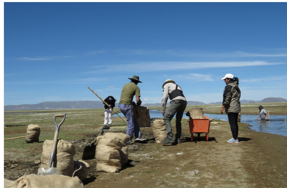
Construction work Rio Chico