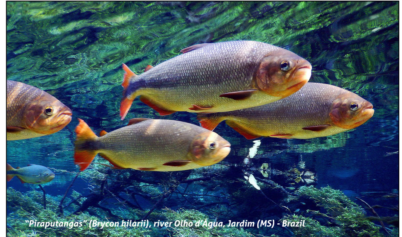
"Piraputangas" ( Brycon hilarii ), river Olho d'Água, Jardim (MS) - Brazil

sectors, who are contributing, or can potentially provide significant contributions to advancing the LAC strategy. Our intention is to strengthen already existing collaborations at the same time as expanding to new partnerships from non-traditional segments, such as the aid and human rights, international organisms and private sectors.