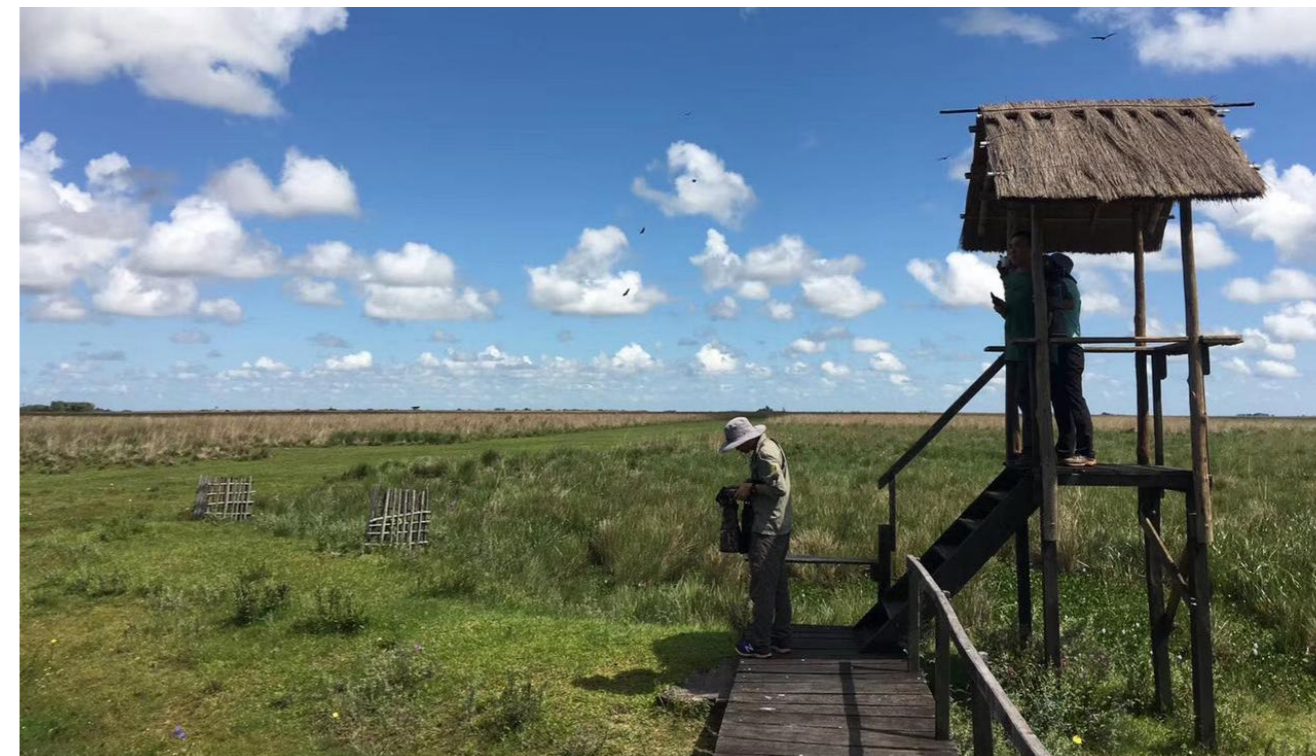
Esteros del Iberá

The array of complex challenges which WETLANDS INTERNATIONAL has to face in the region include political aspects such as the limited consideration of wetlands in national and global policies and the difficulties to implement global environmental conventions; the relevant bulk of scientific and technical information available for the region and the need to build linkages with policies or use them in support of decision making, the rapidly growing economies pressuring for overexploitation of natural resources, increase of poverty and social inequality, the impacts of climate change such as ocean acidification accelerating the loss of life in coral reefs, and the economic recession that reduces the availability of funds for biodiversity from traditional donor countries.