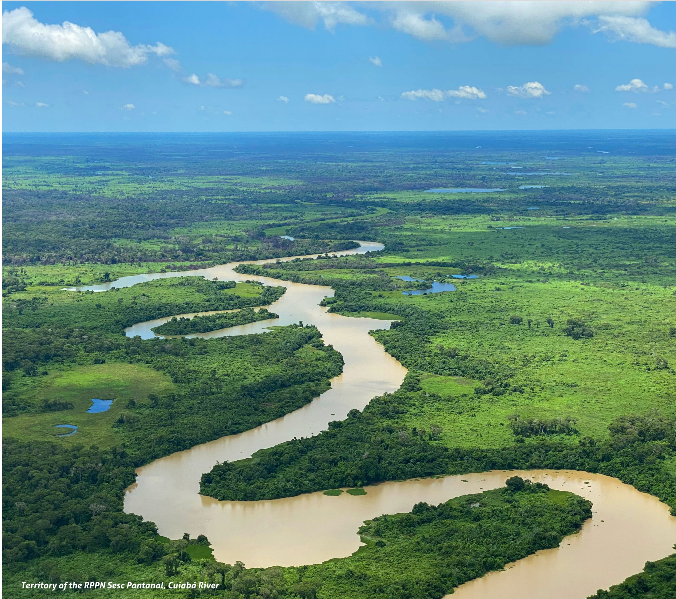
Territory of the RPPN Sesc Pantanal, Cuiabá River