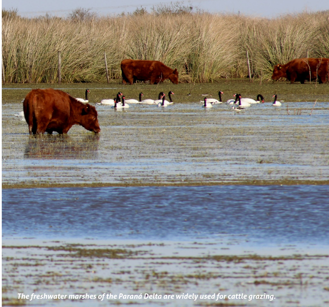
The freshwater marshes of the Paraná Delta are widely used for cattle grazing.

Latin America and the Caribbean are home to almost 60% of the terrestrial life on the planet, together with a diverse marine and freshwater flora and fauna (UNEP, 2016). The region is characterized by a wide range of ecosystems, ranging from dense tropical forest and grasslands to estuaries and wetlands. The complex tapestry of political, social and natural contrasts made evident in the spectrum of the sizes of countries and economies; in the diversity of geographical and ecological features; and in the manners in which cultures continue to interact with the natural environment.